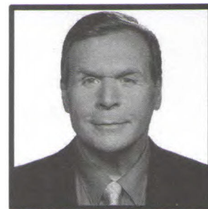
J. D. Hayworth Member of Congress (ret.)

-- Jerry Nadler Chairman, House Judiciary Committee