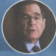
Jerrold "Fat Jerry" Nadler (D-NY)