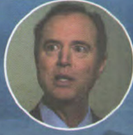
Adam "Pencil Neck" Schiff (D-CA)

Here at Freedom Watch, we're not just protecting the President and seeking to indict, prosecute, and jail leftists behind the "RUSSIAN COLLUSION" lie like Mueller, Pelosi, Maxine Waters, and other Democrats. We also have ongoing, hard-hitting lawsuits against: