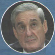
"Disgraced and Disgruntled" Robert Mueller