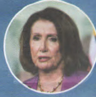
Nancy "The Wicked Witch of the West" Pelosi (D-CA)