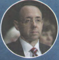
Assistant AG Rod "Benedict Arnold" Rosenstein