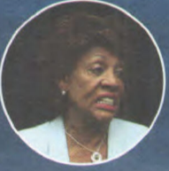
Maxine "Looney Tunes" Waters (D-CA)